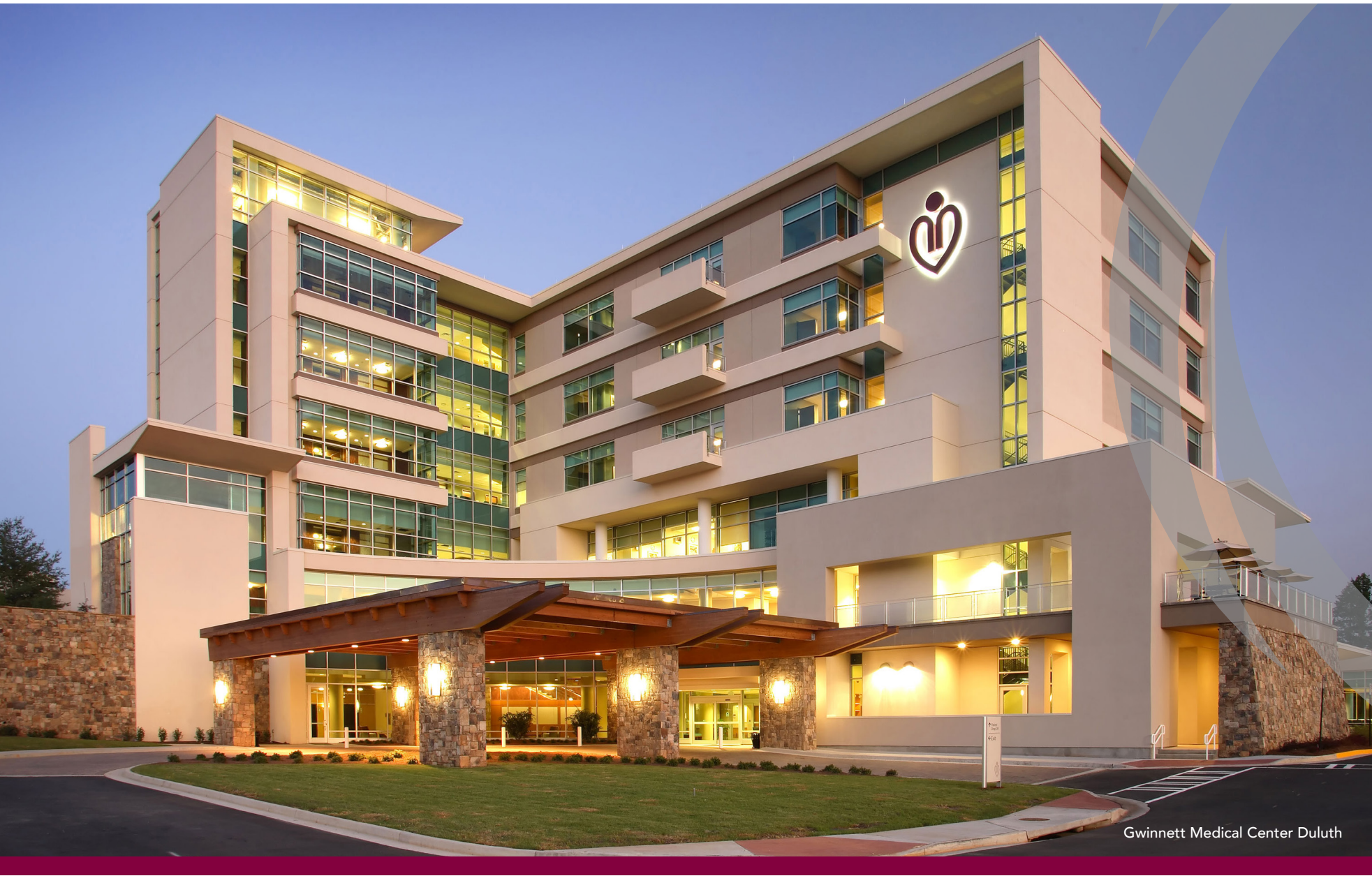
Gwinnett Medical Center Duluth